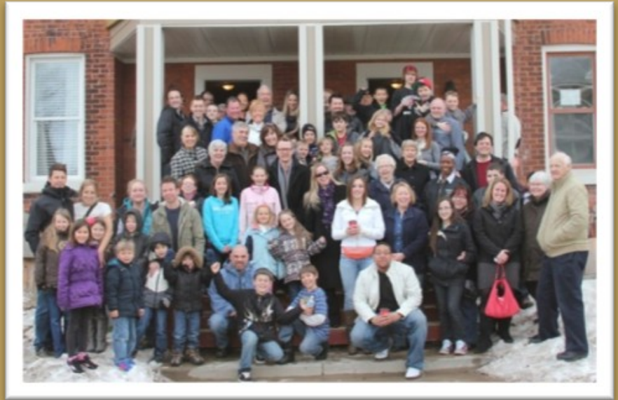
Many volunteers and donors joined us for our Open House in April, before families moved in.

RPC is very excited about our next project, as we move forward with plans to partner with the Salvation Army to tackle the lack of emergency and transitional housing for families in Barrie. Stay tuned for more updates on this project, and two new fundraising events in 2014!